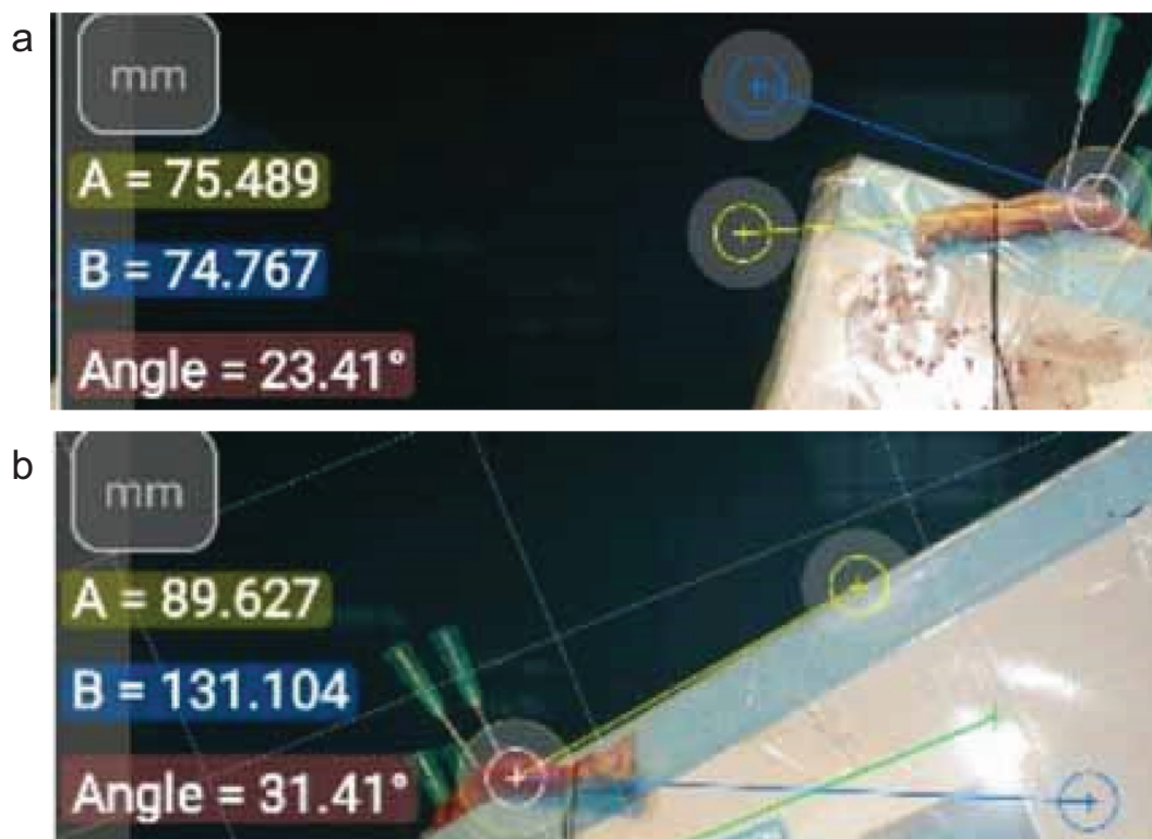
Figure 1. a, b. Rotation measurements on sacrificial rat shoulders made with the Partometer3d-vistech.projects program. In Figure a, the yellow A line was drawn on the ulna shaft while the blue B line was placed parallel to the scapula, and the angle between two lines was measured as internal rotation. On the other hand, in Figure b, while the yellow A line was drawn parallel to the scapula, the blue B line was drawn on the ulna shaft, and the angle between the two lines was measured as external rotation.

Scapula was pinned on the front side of Styrofoam (thoracic side facing to Styrofoam), allowing the humerus motion only on abduction and adduction plane. The same 10-g weight was attached to the distal end of the needle (~20 mm). The specimen attached to Styrofoam block was turned on the abduction plane, until humeral shaft was parallel to ground and photographed. Abduction ROM was defined as the angle between spina scapula and humeral shaft.